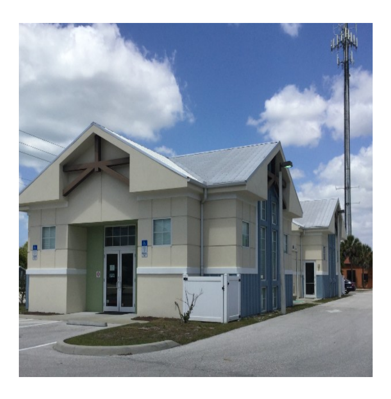
Main entrance. Note cell tower near fire station