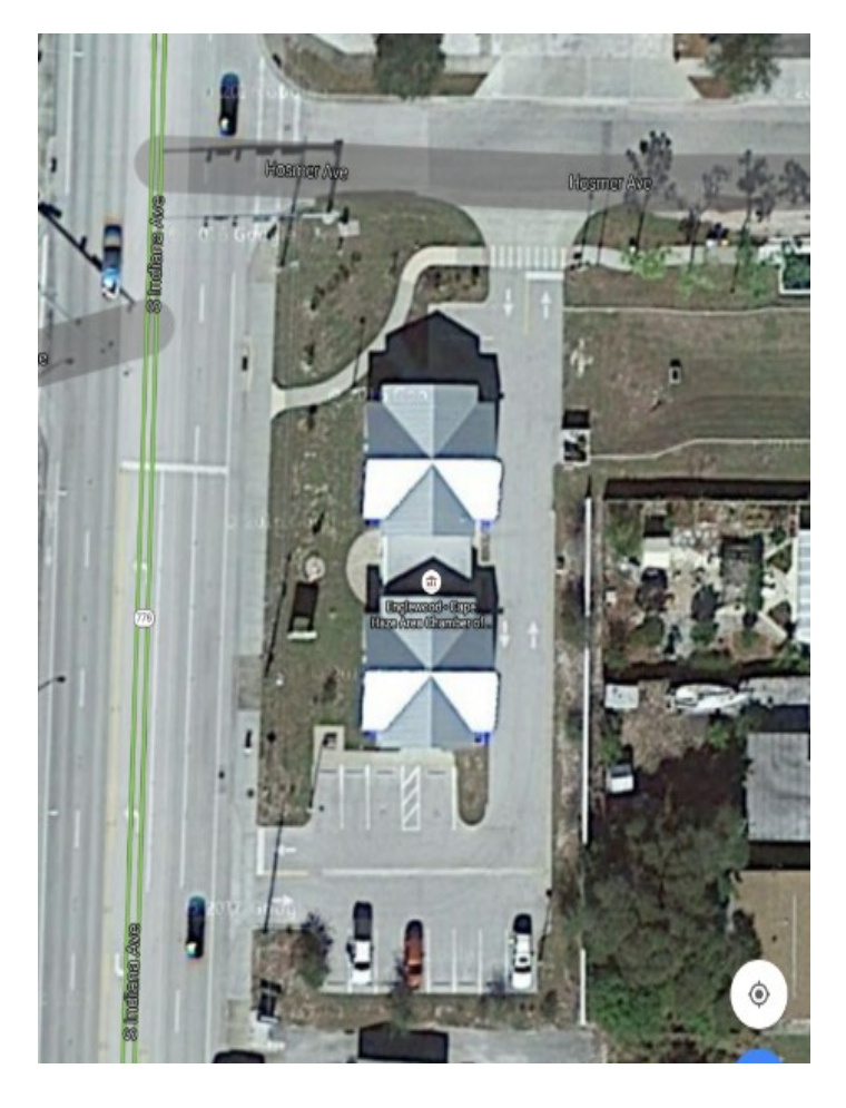
Parking in marked spots as well as the rear driveway