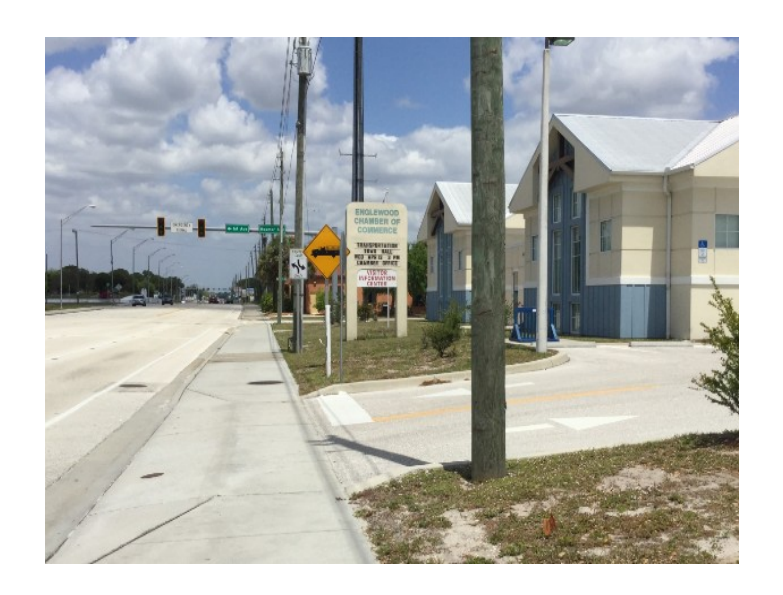
Looking North toward the fire station

Starting Tuesday April 19<sup>th</sup> we will be holding our meetings at the Englewood Chamber of Commerce, located at 601 South Indiana Ave (RT 776). The chamber is at the corner of Hosmer St.