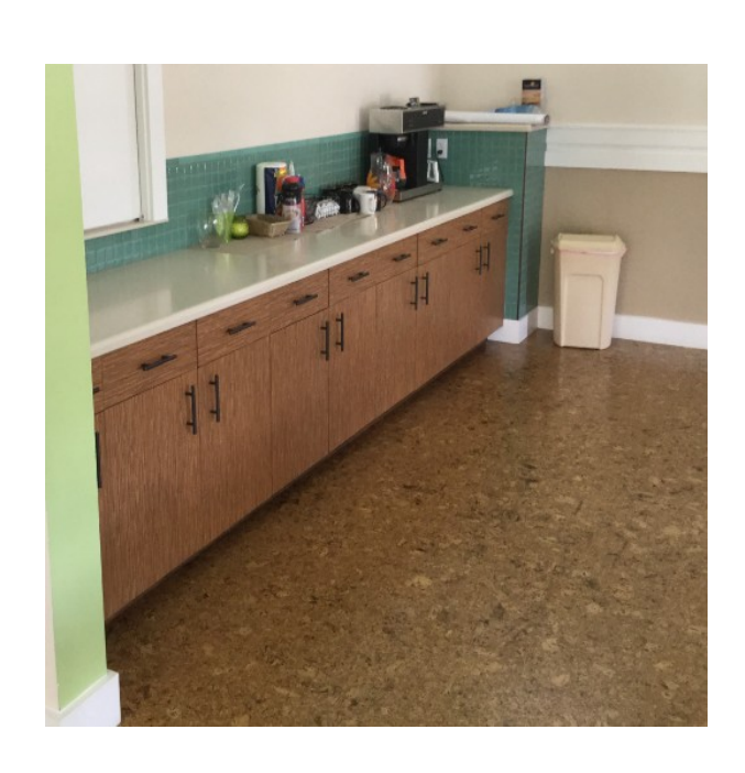
Coffee counter in meeting room