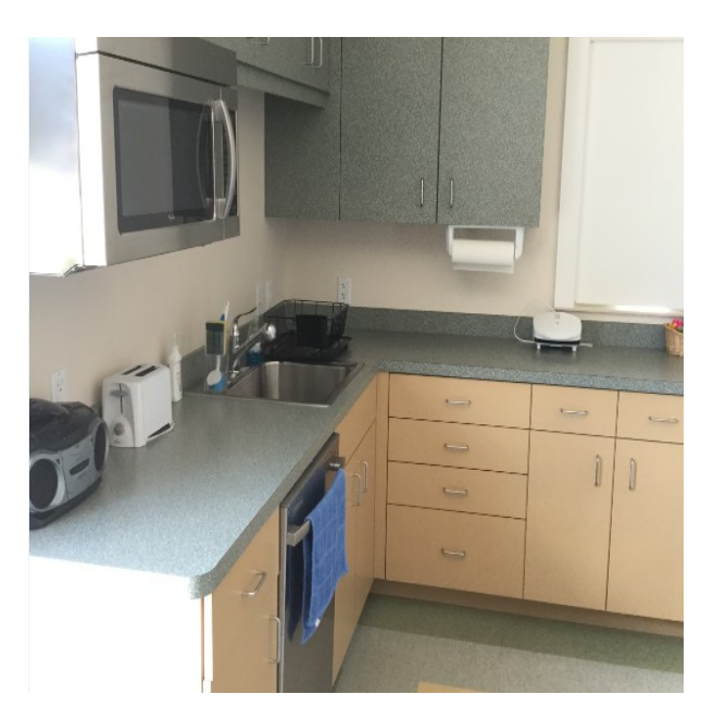
Kitchen if needed