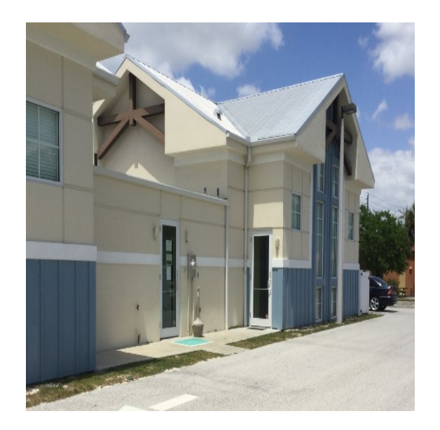
After hours entry through either door at rear opens to the community room. (north half of the building)