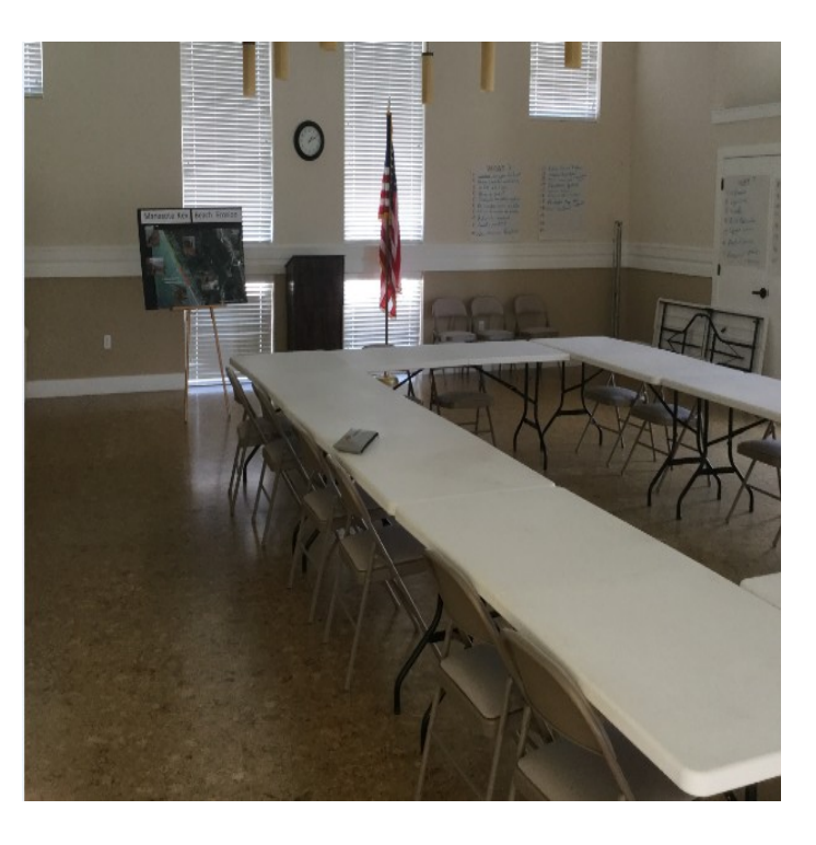
Meeting room. Flag, wi-fi, and projection screen