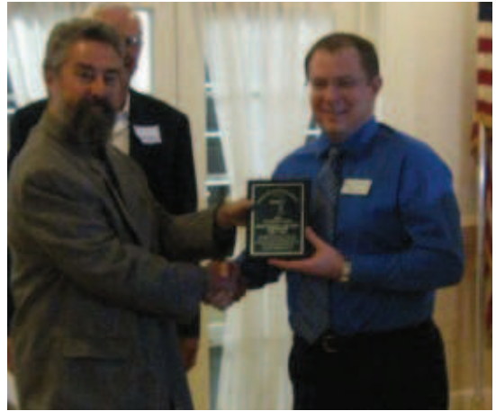
Tuesday Breakfast Group