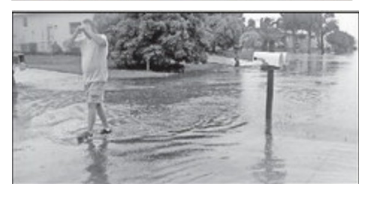
Perry Street flooding