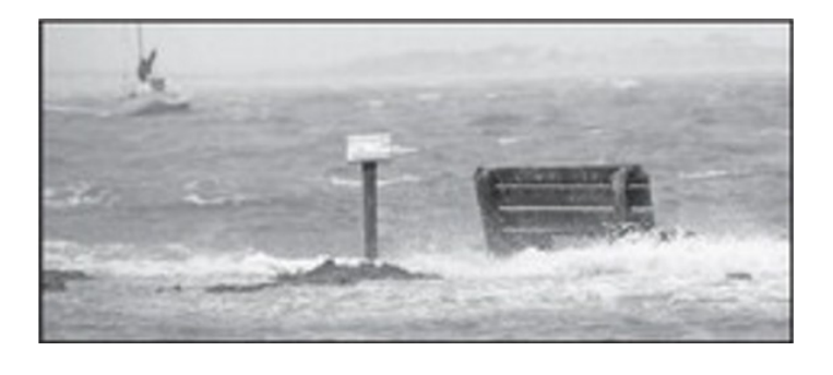
Indan Mound flooding