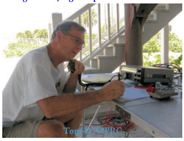
Lighthouse/Lightship Weekend Pictures