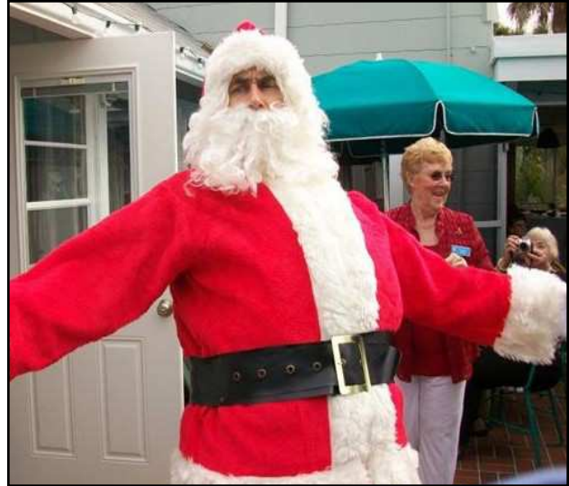
Santa was heard wishing everyone, "Merry Christmas to all and to all a good night!"