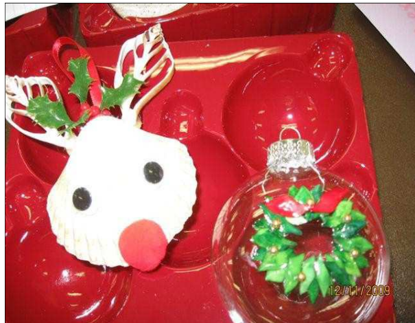
A shell reindeer and an ornament wreath made from gar scales. Note: Upcoming projects will be displayed at General Meetings along with the sign-up sheets.