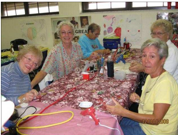
ShellCrafters having fun in December working on Christmas ornaments.

Jan. 07, Noon — 2 pm., Shell-decorated wall plaques Feb. 11, Noon — 2 pm., Shell flowers and butterflies Mar. 11, Noon — 2 pm., Jewelry