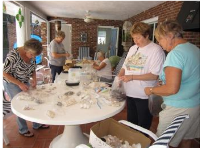
Sorting Shells for the March Shell Sale