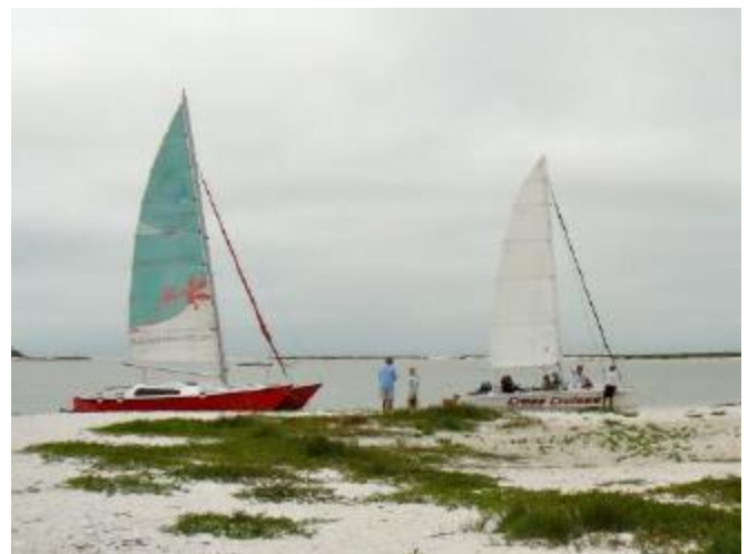
Marco Island trip