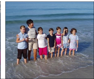
Brownie Troop #411 learns about shelling on Manasota Key.