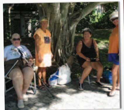
COOLING OFF IN THE SHADE