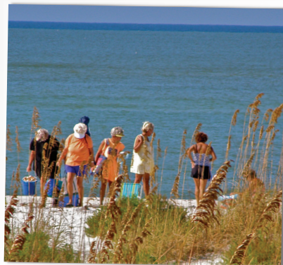
SUN, SEA, SAND - PERFECT