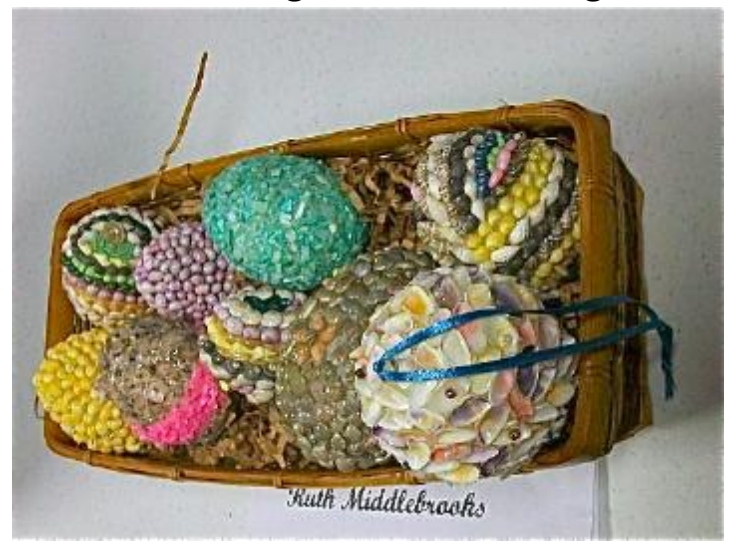
Members brought Show and Tell Work to Share