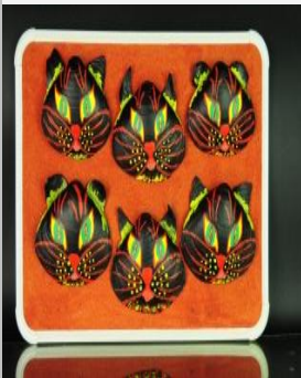
CLAM SHELL HALLOWEEN DECORATIONS – CHECK OUT THE 'HOW TO' AT http://allaexpression.com/blog/holidayhalooweenornament_part1/

This year finds the Shell Crafters with a new home. Our new location will be at St. David's Episcopal Church, 401 South Broadway, Englewood. The space at St. David's Episcopal Church allows us to hold classes and store our shells. A heartfelt THANK YOU to all the helpers who moved the shells to our new location.