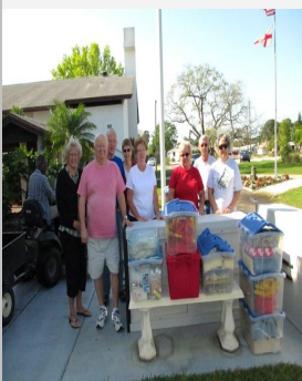
Thanks to the Shell Crafter Moving Brigade last Spring