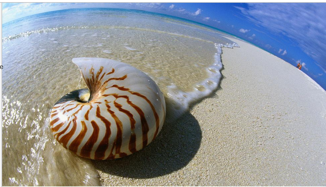
THE TIDE - Author Unknown

The tide recedes, but leaves behind bright seashells on the sand. The sun goes down, but gentle warmth still lingers on the land. The music stops, yet echoes on in sweet, soulful refrains. For every joy that passes, something beautiful remains.