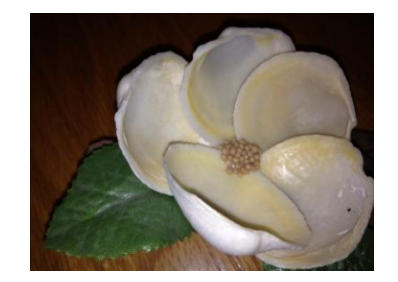
March 21 - Baskets decorated with shells