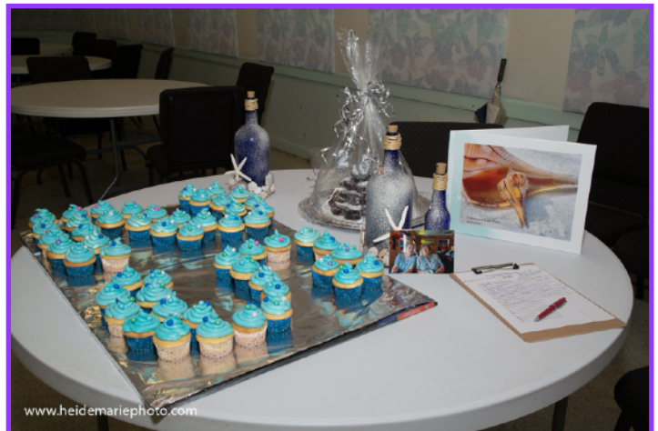
Goody bags made by secret members & frosted cupcakes baked by Colleen Fosnough!